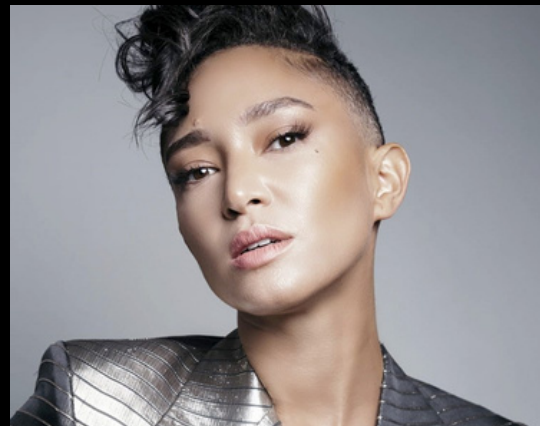
Two of America's Next Top Models to Host Cayman Islands Upcoming Fashion Week on Saturday, April 1st at the Ritz-Carlton