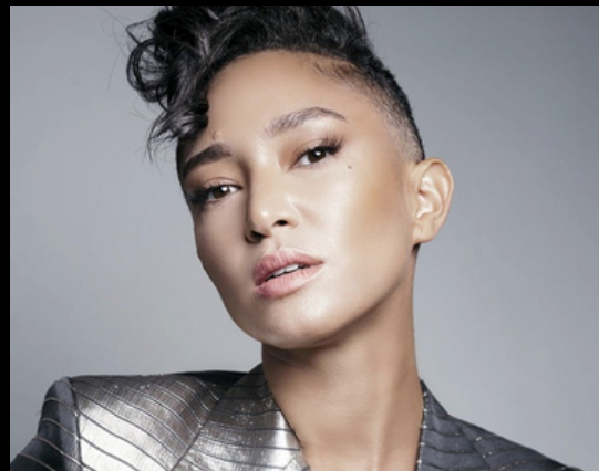
Two of America's Next Top Models to Host Cayman Islands Upcoming Fashion Week on Saturday, April 1st at the Ritz-Carlton