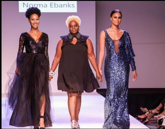
Caymanian models to walk runway at New York Fashion Week