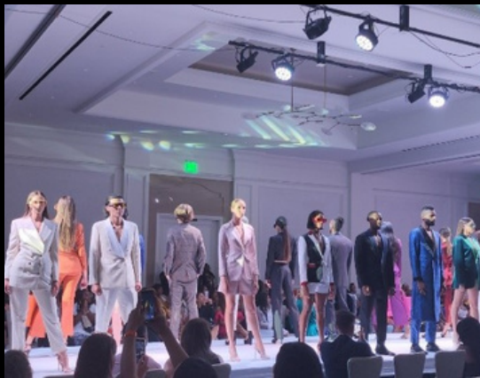
Cayman InStyle Fashion Week wraps up with runway show at Ritz-Carlton